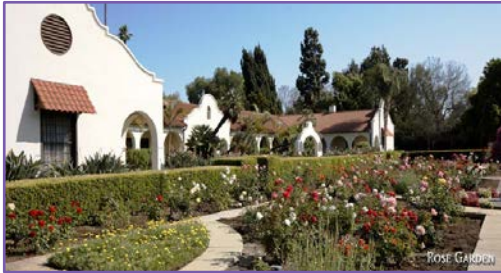
Dominguez Rancho Adobe Museum: