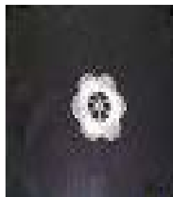
Sharon's Bruges flower