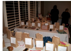
WLC Raffles Prizes