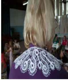
Julia's collar back