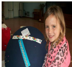
Grace's lace for ornament