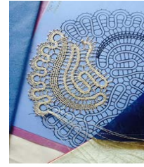
Liz's Idrija lace