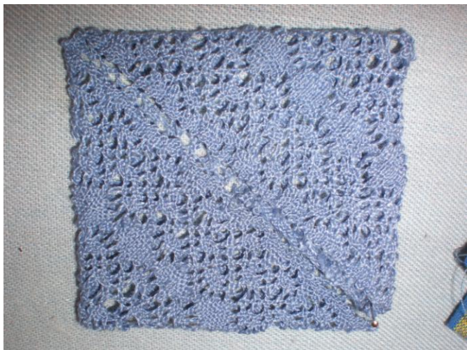
Betty C. - Origami lavender bag (pattern attached)