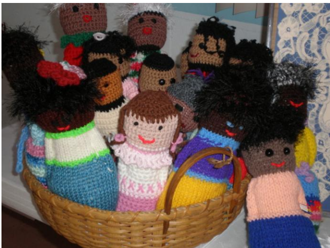
Knitted dollies for Haiti (1)