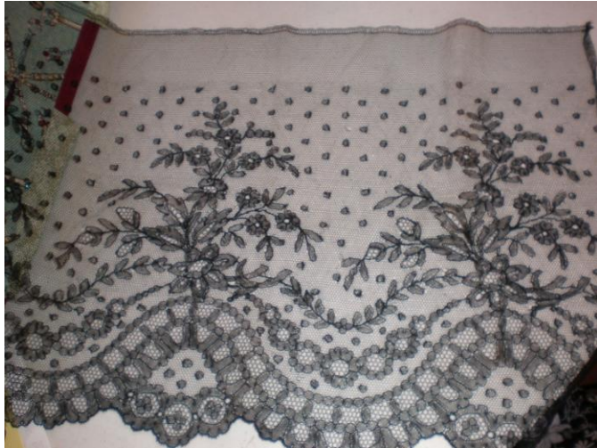
Marilyn N. - Chantilly Lace (purchased)