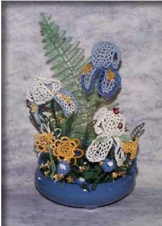
Tatted 3D Iris (front) Dale Pomeroy AKA madtatter