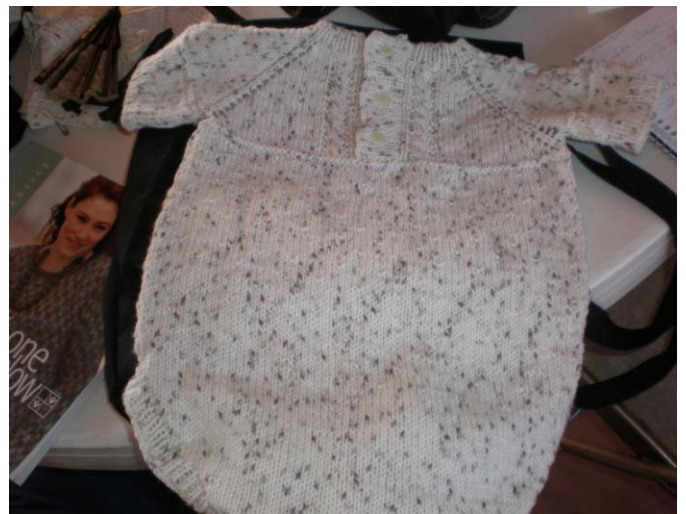
Rita T. - knitted onesie