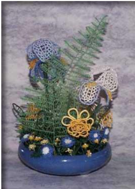
Tatted 3D Iris (back) Dale Pomeroy AKA madtatter