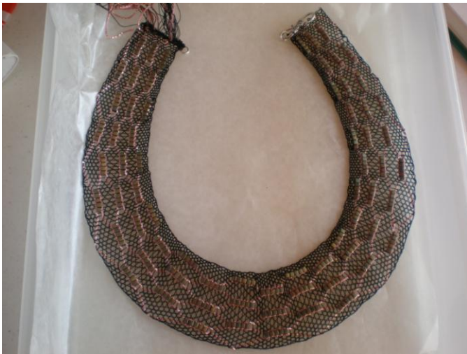
Colette K. - wire lace necklace