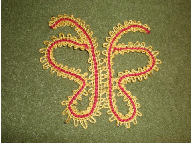
D'Ann B. – butterfly (first one, yeah!)