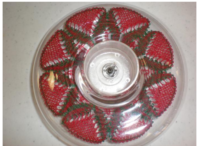
Maria P. - modern Torchon Lace mix