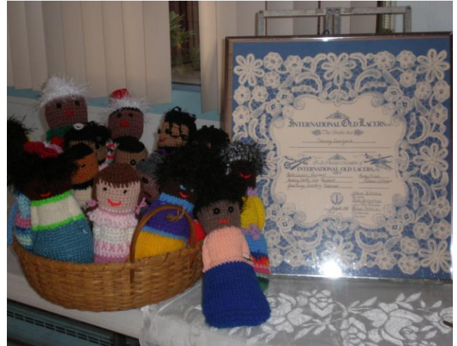
Knitted dollies for Haiti (2)