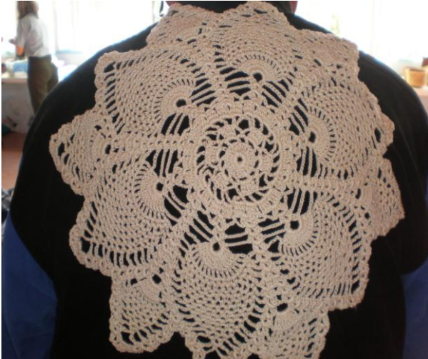
Colette K. - crocheted pineapple doily