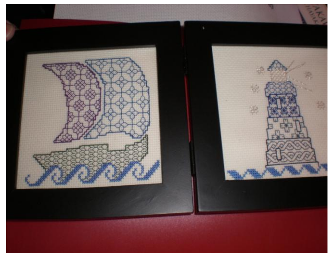
Alan B. - black work sailing ship & lighthouse