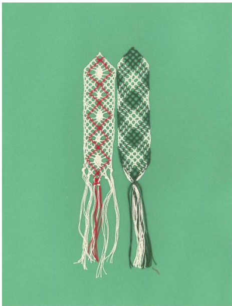
D'Ann B. Torchon spider bookmark