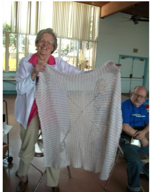
Bette C. tablecloth