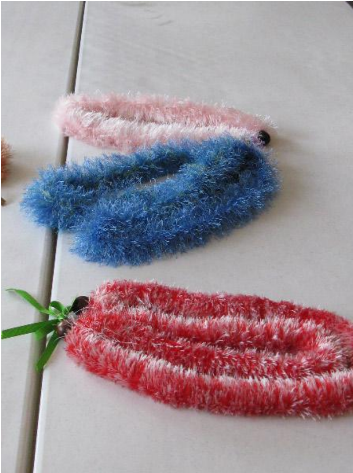
More Hawaiian Leis