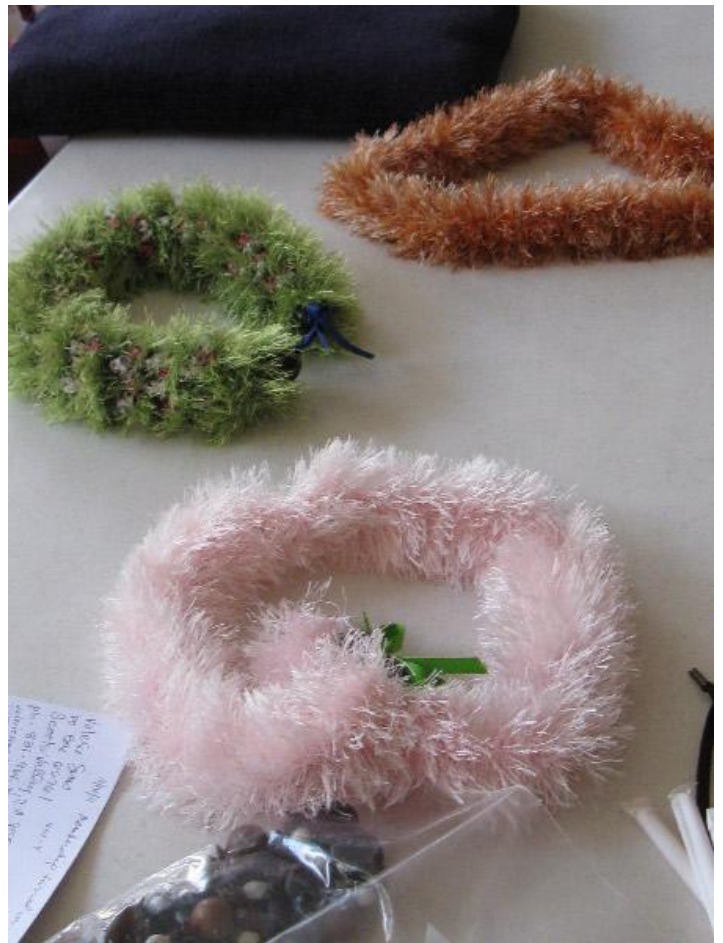
Hawaiian Leis Class—so pretty!